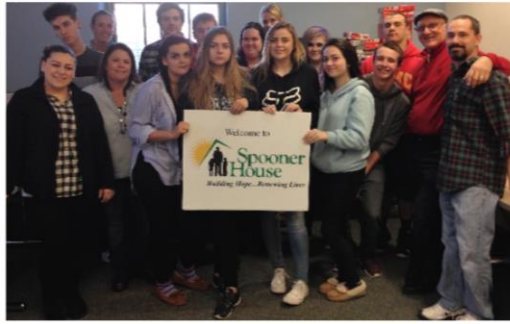
OHS Connections Students at The Spooner House