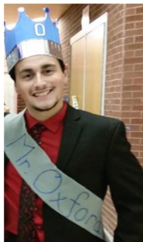
Mr. Oxford High School Winner 2016-2017