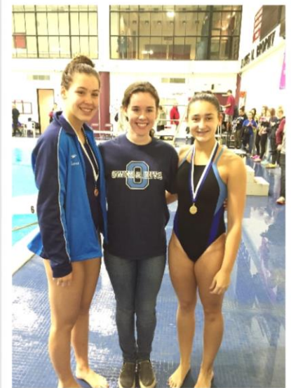
OHS State Diving Championship