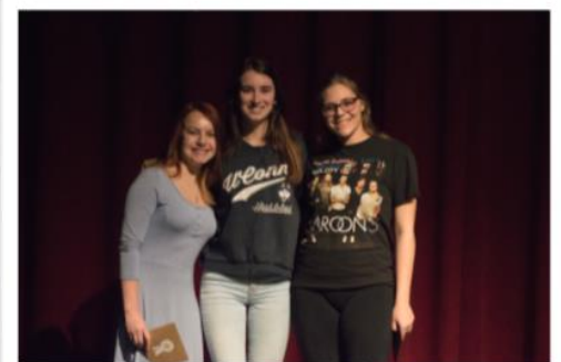
Poetry Out Loud Winners 2016-2017