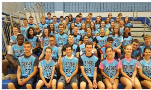
OHS Unified Sports Team