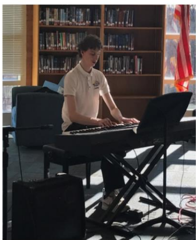
Live at the LMC